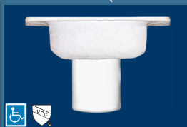
Waste Disposal Cover 3071WD-H (Evolution)