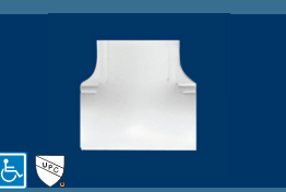
3200W Thermostatic Mixing Valve Cover