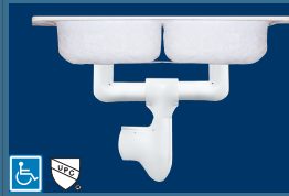
Kitchen Center Outlet Cover 3061-CO