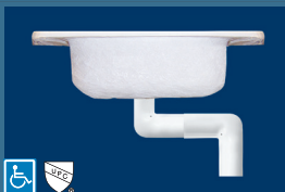
Bar Sink/Kitchen Offset Cover 3051-XL