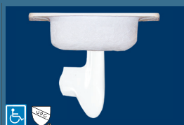
2" P-Trap Cover 3011-2