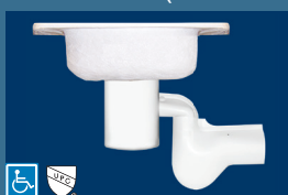
Waste Disposal Cover 3071WD-P37 (Pro-Series)