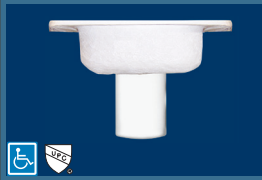
Waste Disposal Cover 3071WD-N